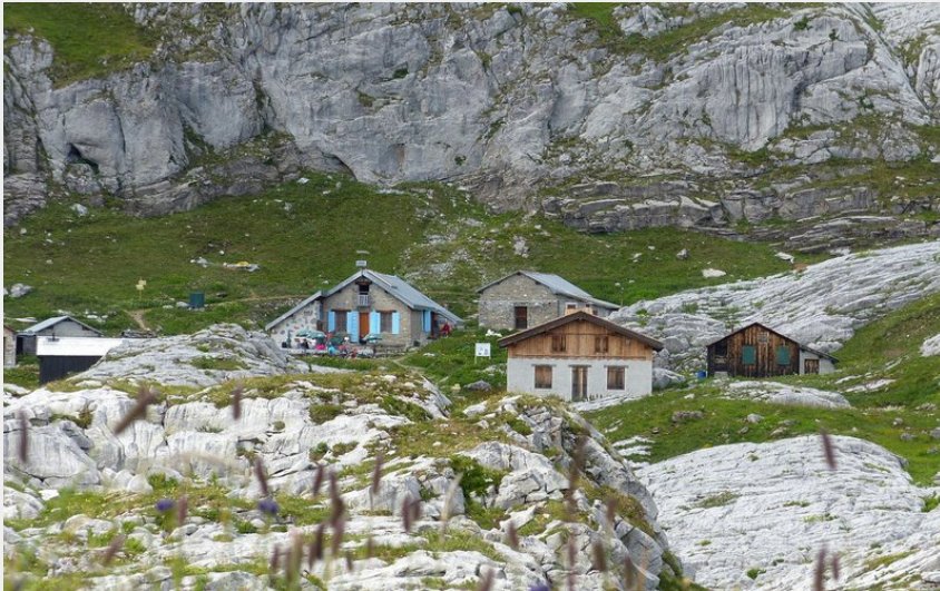
Les chalets de Platé (Lucie Rousselot - CEN 74)