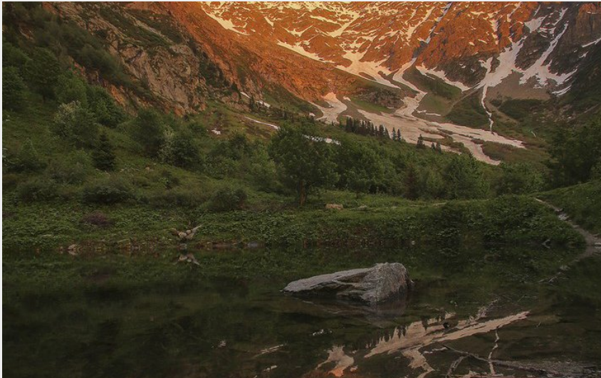
Lac d'Armancette