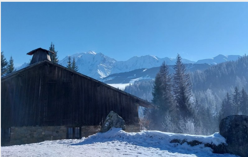
Vue mont Blanc (@julietteBuret)