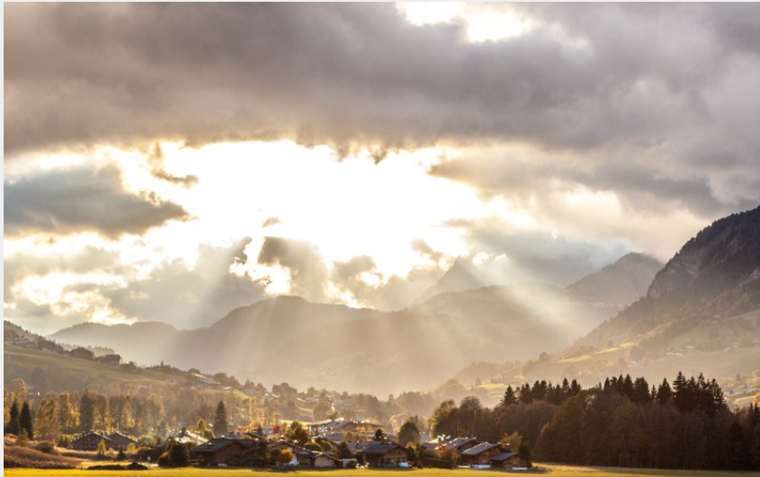
Rayon de soleil sur Megève (@CeciliaGranger)