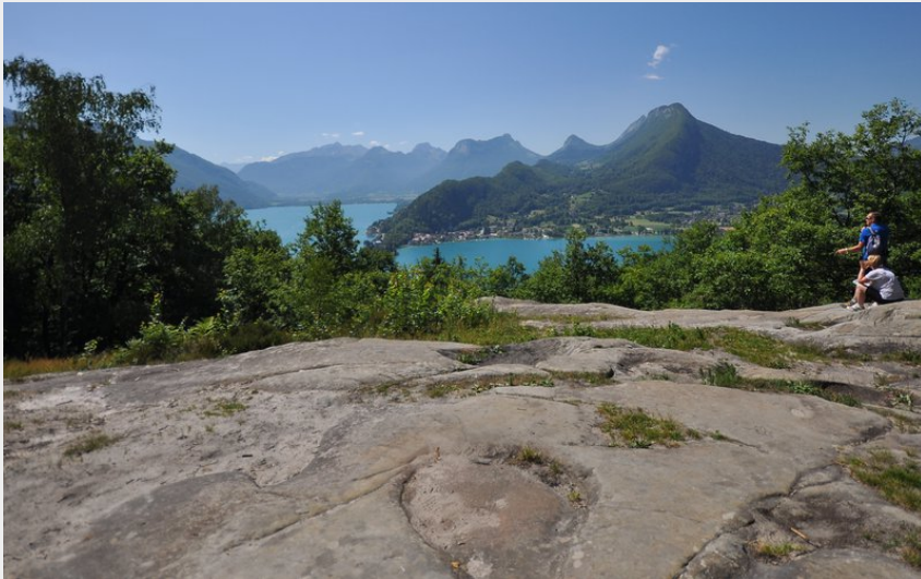
Belvédère de grés